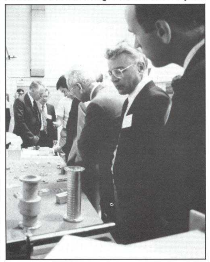
Visitors view microwave parts exhibit.