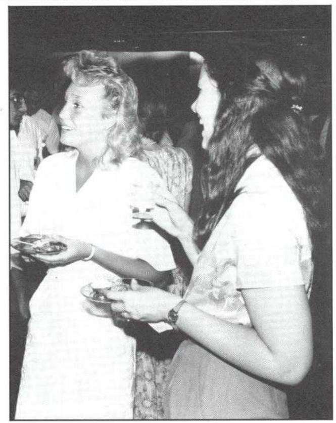
Fellowship followed exhibit tour.